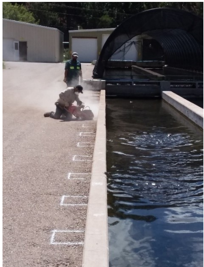
Contractors are preparing the asphalt for the concrete piers that will support the cold frame structure.

Today, the construction of a 3 rd canopy is underway. The contractor is familiar with this project as they have constructed the previous canopies.