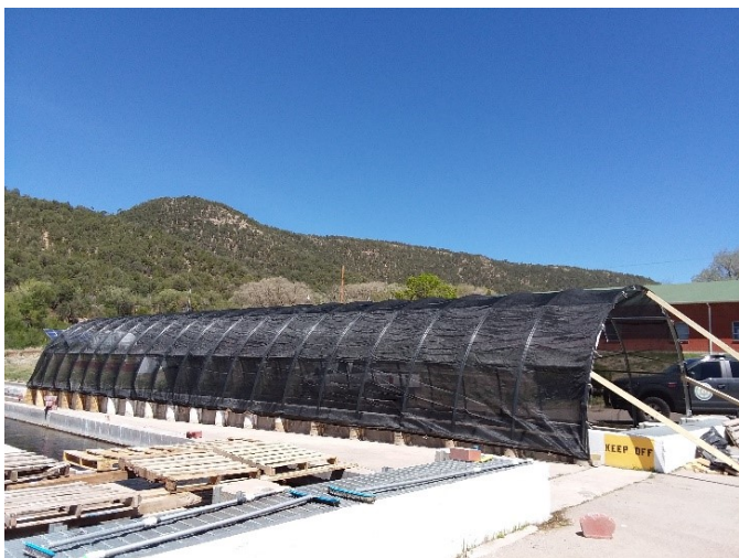
2017 - The 1 st canopy that was constructed for the outside raceways.

In early 2017, the SWTFC purchased the materials to construct 6 canopy shade coverings over the outside raceways. The purpose of the canopy covers is to protect the rainbow trout from predators, will reduce the growth of algae, and create a stress-free environment for the fish. In April of 2017 the 1 st canopy was erected over 2 outside raceways. Soon after, the 2 nd canopy went up. After a few adjustments to the coverings and any open spaces, the canopies are proving to serve their purpose. Algae growth has been reduced which, in turn, means less cleaning of raceways which leads to less stress on fish. Fish are daily protected from predators, particularly the Great Blue Herons.